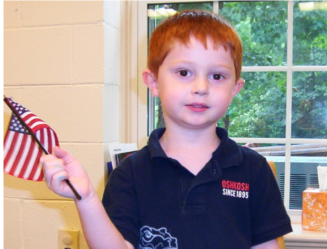
“I Pledge Allegiance to the Flag”